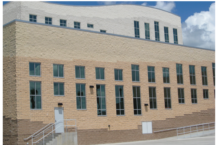
Rainbow Custom Color Masonry used on Naples Daily News Building

While climate conditions, exposure and engineering requirements must be considered, Type N mortar, 5 MPa (750 psi), is recommended for above-grade interior and exterior load-bearing and non-load-bearing walls. Types S and M mortars are a higher compressive strength of 12 and 17 MPA (1800 and 2500 psi), respectively, and are recommended for below grade walls and load-bearing walls where higher compressive strengths are needed.